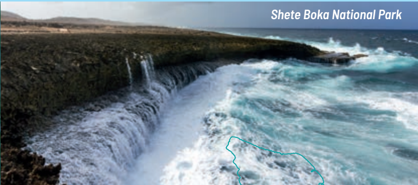
Shete Boka National Park