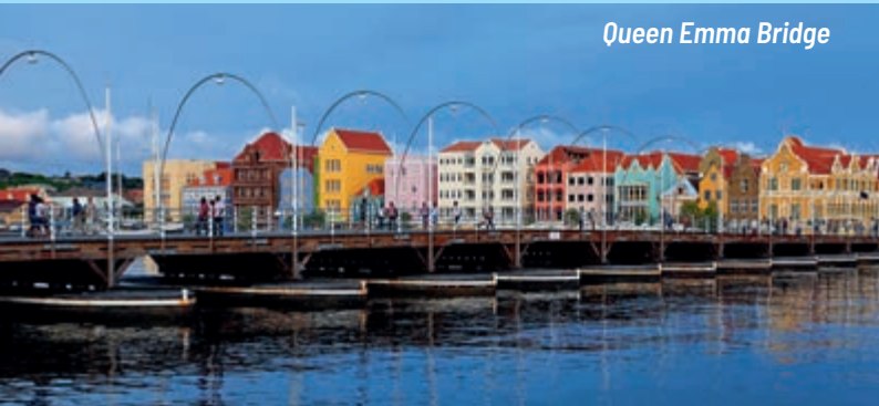
Queen Emma Bridge